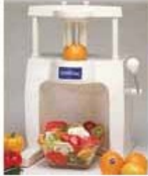
Fruit & Vegetable Wedger & Slicer