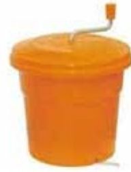
Salad Dryer 5 Gallon Capacity, 17\"/>