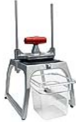
Large Size InstaCut - Complete Unit